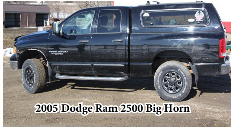
2005 Dodge Ram 2500 Big Horn

2005 Dodge Ram 2500 Big Horn: One Owner, Black, 4x4, 4-Door Quad Cab – 5.91 Diesel – 136,000 Miles – 6 SP Manual Transmission – K&N Ram Air Filter – Banks Monster Exhaust – Raider Fiberglass Topper with Side Doors – Spray on Bed Liner – Roll-Out Bed Drawer with 1200 lb. Capacity – Aftermarket Black Aluminum Rims – Cooper Load Range E Tires and Firestone Adjustable Rear Air Bags