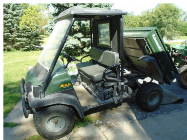
'03 KAWASAKI MULE VIN #JK1AFCE1338528091 4 WHEEL DRIVE – 1,663 HOURS – NEW TIRES – NEW BATTERY – BACK END DUMP W/LINER RUNS LIKE NEW HAS CERTIFICATE OF ORIGIN