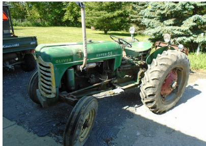
SUPER 55 OLIVER CLASSIC TRACTOR SS# 48103518 – ID# 25-0007 WIDE FRONT 3PT HITCH NEW TIRES