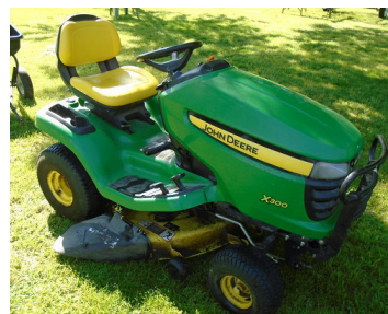
'07 JOHN DEERE X300 RIDING MOWER 1 OWNER 205 HOURS